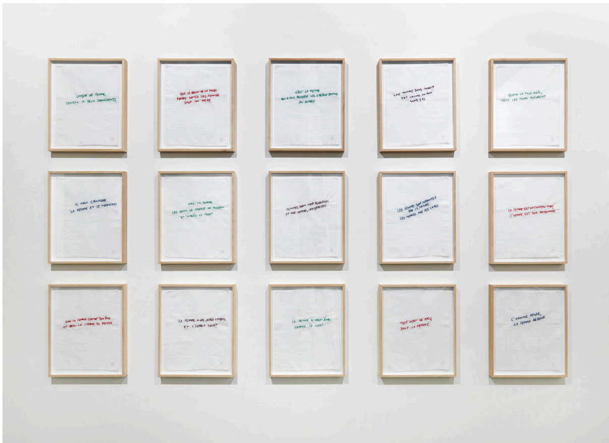
Annette Messenger Ma collection de proverbes

Today true pieces of history, the collection-albums appear surprisingly strikingly contemporary, considering the reactions they are still able to generate.